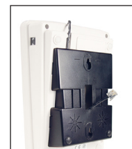
Wall Mount Bracket Kit with short line cord sold separately.